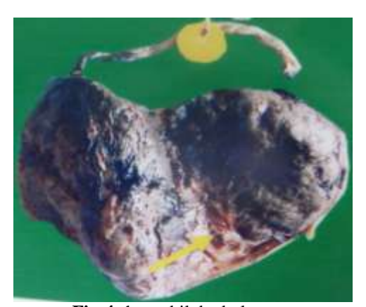
Fig-4 shows bilobed placenta